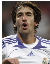
Raúl Gonzalez Blanco Fmr Star, Real Madrid