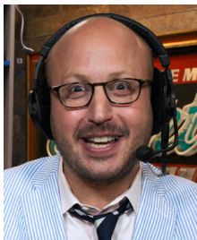
Roger Bennett Host, Men in Blazers